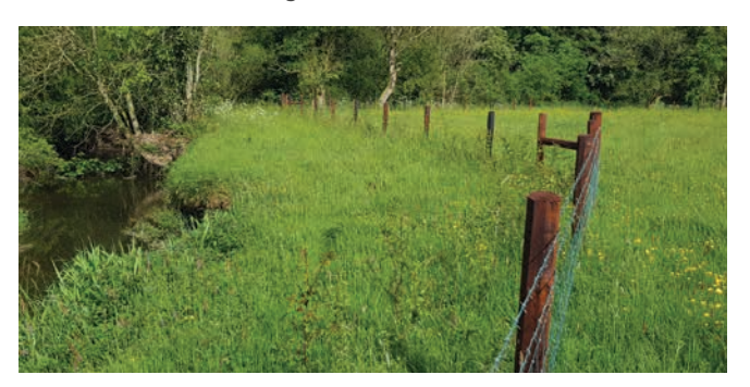
FIGURE 1: Smart Buffer – Stranooden, Co. Monaghan

The National Federation of Group Water Schemes (NFGWS) represents and works with the community-owned rural water services sector in Ireland. The NFGWS helps local authorities and individual group water schemes identify and address water quality issues and risks. An example of a risk is farm animals accessing the water source and contaminating it. The source can be protected by installing fencing - a measure known as a 'smart buffer' (pictured). The NFGWS also assists schemes to access funding from the Department of Housing, Local Government and Heritage.