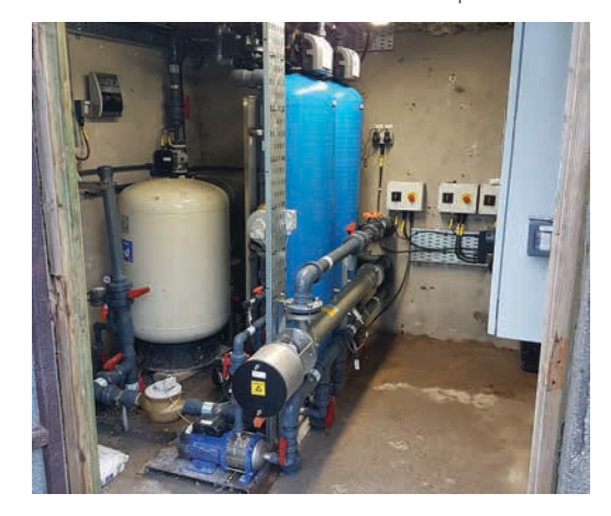
FIGURE 4: Upgraded treatment system at Coole Group Water Scheme, County Galway

The Department has also set up a working group to review the governance of how private water supplies and private wastewater treatment systems are monitored, maintained and financed. The outcome of this review is expected in 2022.